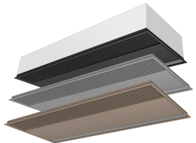
Customizable inlet grille in RAL color optionally