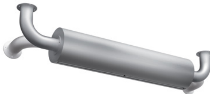
Wall/ceiling fixation through arms