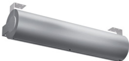
Wall/ceiling fixation through angle supports