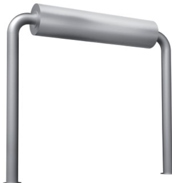
Floor fixation (goalpost)