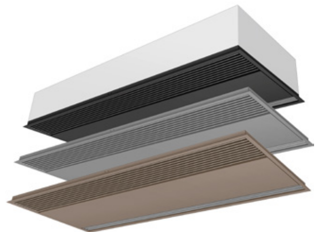
Customizable inlet grille in RAL color optionally